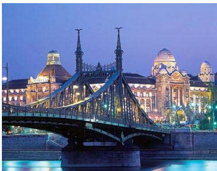
The hotel Gellert at night