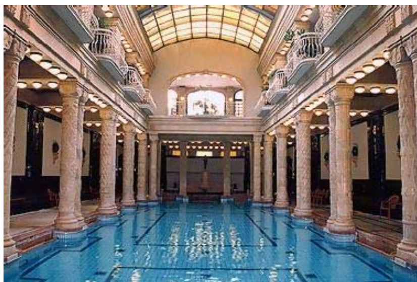
Indoor pool, Gellert Bath