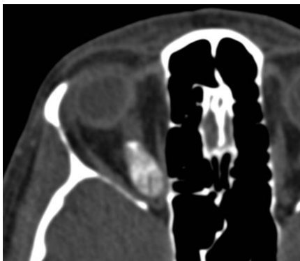
Figure 1a: transverse non-enhanced CT, soft tissue window

57-year old female patient with decreased visual acuity on her right side